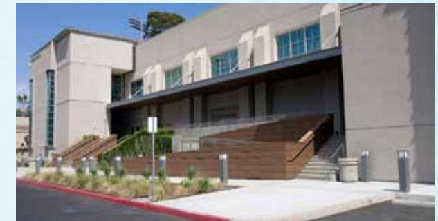
Newly renovated Wheelock Gymnasium – Riverside City College

Riverside City College Digital Library & Learning Resources Center, Rm. 409 4800 Magnolia Avenue Riverside, CA 92506