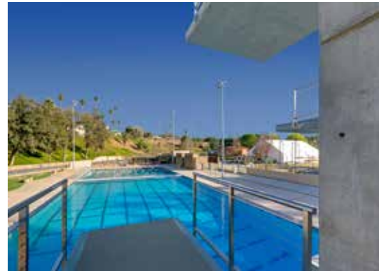
Riverside Aquatics Complex – Riverside City College

Riverside City College Digital Library & Learning Resources Center, Rm. 409 4800 Magnolia Avenue Riverside, CA 92506