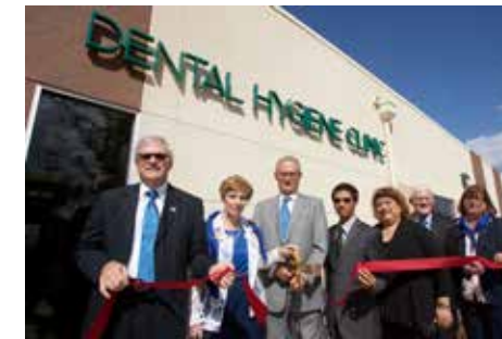
Dental Education Center opening – Moreno Valley College