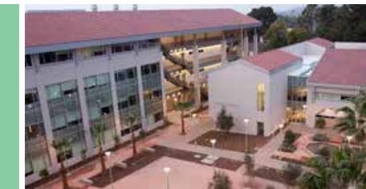
School of Nursing and Science/Math Building – Riverside City College